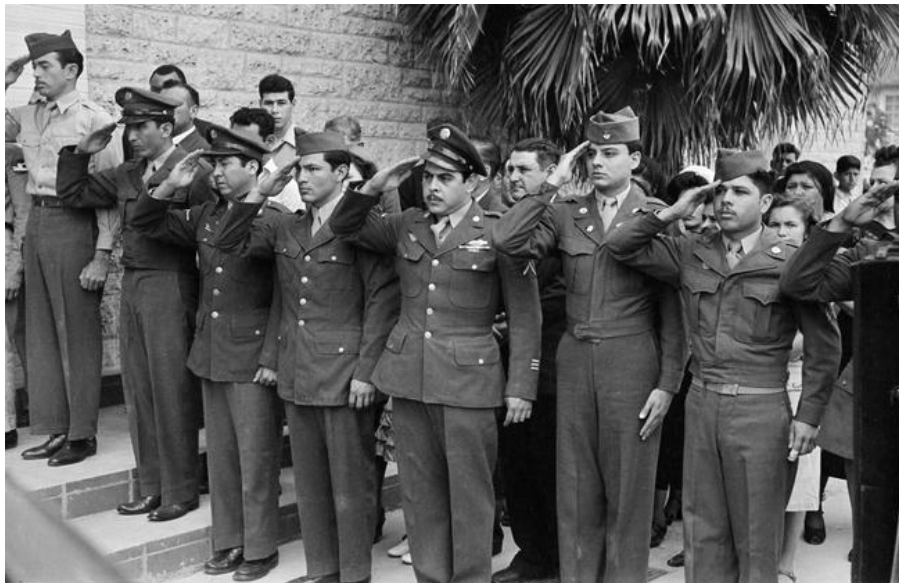
Members of the American G.I. Forum, Corpus Christi, 1949.