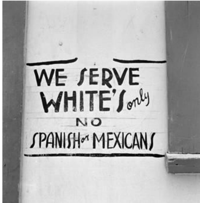
Sign, Dimmitt, Texas, 1949.